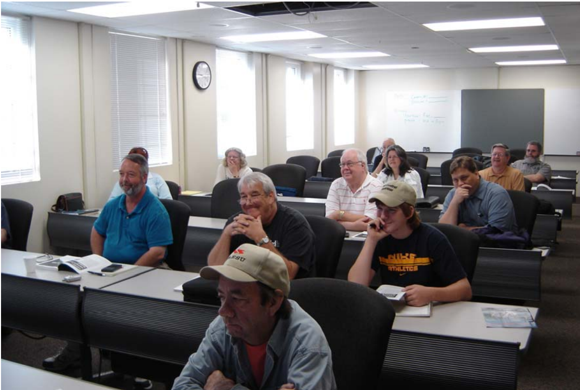
Basic Electronics Class 7-08 Students